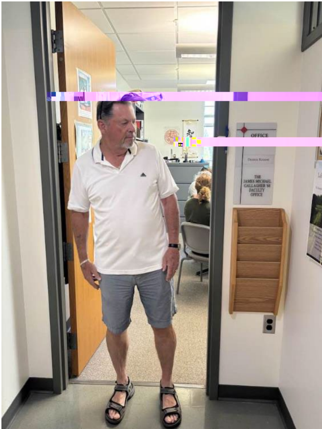
We made a wonderful short road trip to my alma mater @WabashCollege today, toured the state of the Art, new athletic facilities and the office in the physics department that is named after me. Great memories.